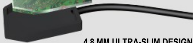
4.8 MM ULTRA-SLIM DESIGN